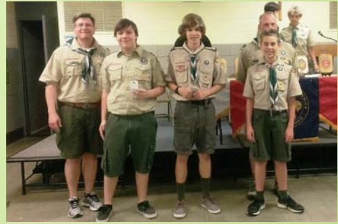
1 st Class