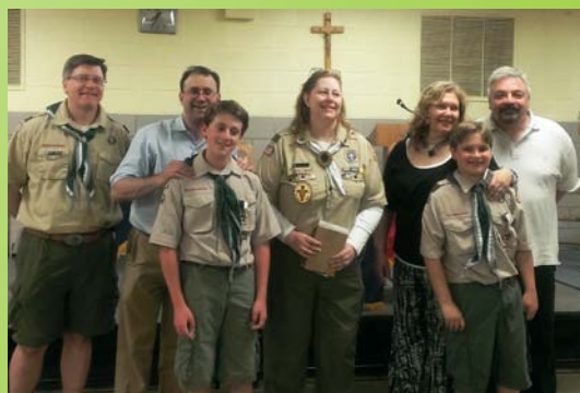
Jewish Religious Emblem

Congratulations to all the scouts that earned merit badges, rank advancements and other special awards!