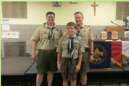
2 nd Class